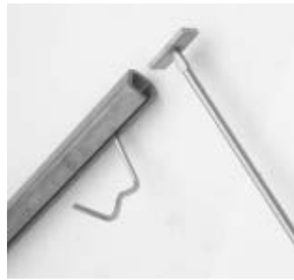
Figure 12. Diamond-Track crossbar and hook mounting detail. This provides ultimate versatility in a general-purpose rack.