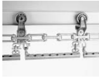
Figure 1. Continuous load bar Angle Pivot™ installation on X-458 short-drop conveyor. Trolley spacing = 16".

1. Most evident upon initial inspection is the equal spacing and equal usability of holes on 2" or 3" centers around the entire system. This is in contrast to the missing notch or hole between the ends of "saw bars" at the trolley or wheel set locations. The effect of this missing notch is to cause the hanging crews to gravitate to a pattern using even multiples of the bar spacing. Bars that overhang the suspension