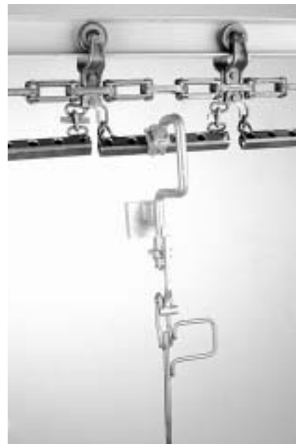
Figure 7. Mechanism at top of C-hook is a compound Angle Pivot™ linkage. This provides 60° incline/decline angle capability without loss of “solid wall” line density.