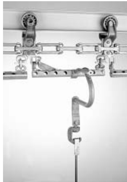
Figure 3. Master C-hook with detachable rack. Note: absence of counterweight; made possible by a rotation stop on the load bar.