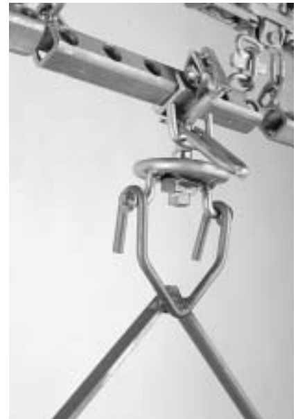
Figure 10. Latching Rotator, with disengagement provided by lifting the latch bar with a track flanking the load/unload area.

permit the upper horizontal element of a C-hook to just clear the grease fittings on the roller turns of external chain conveyor systems. Similar clearance between load bar mounting links and the rims of turn wheels in ovens is also obtained at this altitude. Previously it was mentioned that the torque capability of the bars can be used to avoid the necessity of counterweighting the hooks. Compound linkages can also be incorporated at the load bar engagement point (Fig. 7).