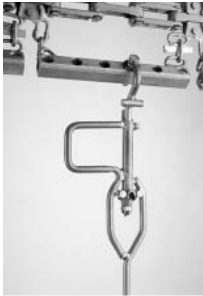
Figure 9. Two-position detented rotator. Bend angle of hardened washer between pins determines self-locking capability.