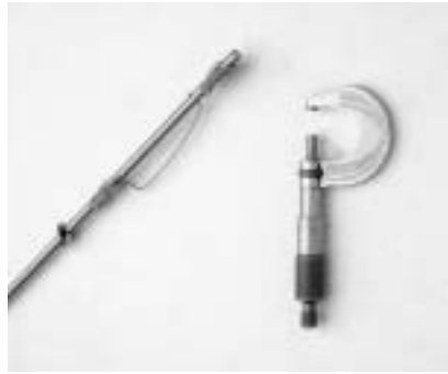
Figure 16. Changeable spring clip pops off like a safety pin. Useable in tube ID's and sufficiently large holes in sheet metal parts.