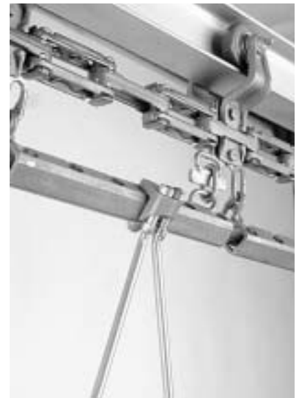
Figure 4. Top end of eyebar rack. Rods rotate in holes in alloy steel bar engagement fitting.

In contrast to the fairly standardized load bars, a wide variety of process hangers or racks has been employed to customize each tooling system for the individual customer's application. People unfamiliar with finishing are tempted to dismiss racks as nothing more than glorified coat hangers. In reality, there can be up to ten different design requirements imposed upon a single specimen. Frequently these conflict, and the art in designing them is knowing where to make the compromises. Controllable out-of-plane rotation is a valuable tool provided by the Angle Pivot™ technique. In this section, devices which occupy the freeboard area between conveyor and work envelope will be discussed. In the next, some useful construction features generally applicable to all racks will be presented.