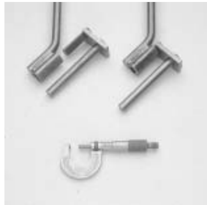
Figure 13. Quick-disconnect joint for spray zone application. Easily disassembled after multiple coats of paint.