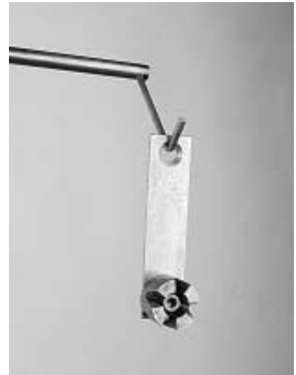
Figure 17. Magnet tab for mounting steel parts lacking holes onto conventional rack hooks.