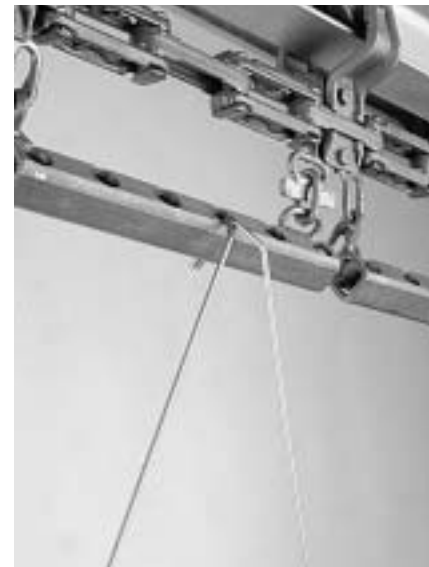
Figure 5. Paired J-hooks with identical ends may be reversed end-for-end to double time interval between strippings.