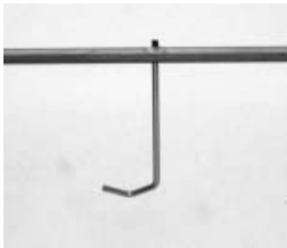
Figure 15. Two good features of a hook: sharp bottom and TIG weld on far side of drilled mount hole.