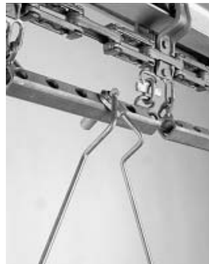
Figure 6. Paired workholder hooks have concentric pins. Also may be used separately to double-hang long parts.

C-hooks and sanitary pans are sometimes used for an additional increment of cleanliness in the washer-through-oven portion of a system. Angle Pivot™ load bars are located at the optimum altitude to