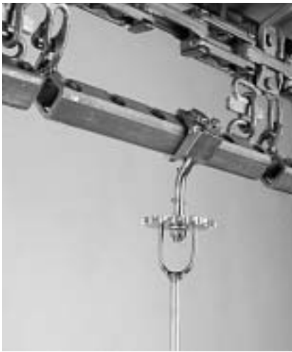
Figure 8. Non-recoil automatic rotator. Contact point with drive gear rack is on extended centerline of Angle Pivot™ bearing.