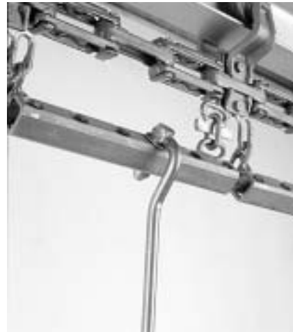
Figure 2. Single rack top going into X-348 load bar. Yaw angle is in proportion to pin axis angle down from horizontal.