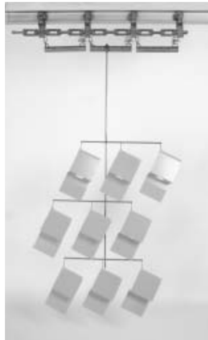
Figure 14. Asymmetric rack with diagonal columns of parts. Saves on vertical envelope space.